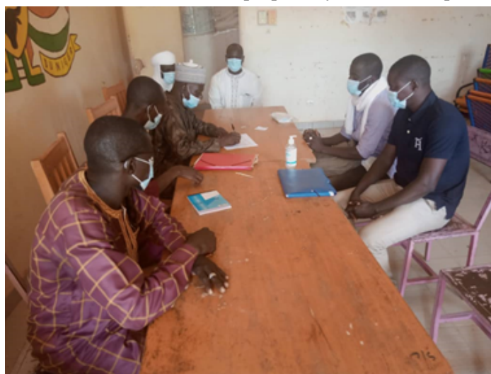
Young Leaders Selection Committee Meeting in Abala

Once the list was established, a physical verification session was conducted to ensure their physical presence, but also a cross-check to ensure that the proposed youth met the predefined criteria.