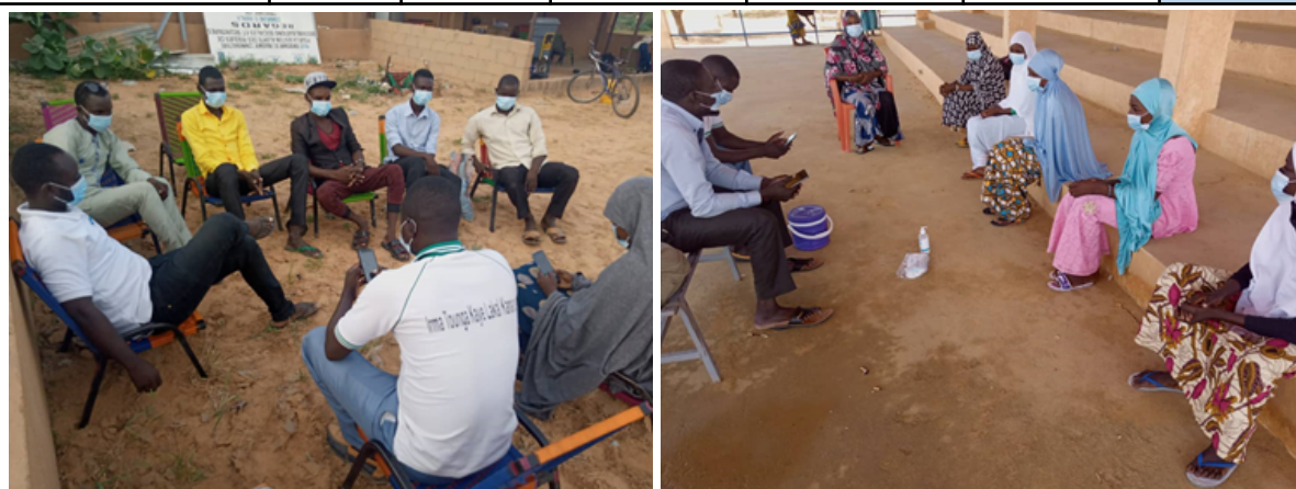
Focus group with young men from Bankilaré and young women from Abala

The KIIs target specific individuals who guided the team in identifying young leaders by cross-referencing information with information from other discussions. In addition, the KIIs will provide a better understanding of gender relations in the community and gain buy-in for greater youth involvement in project implementation.