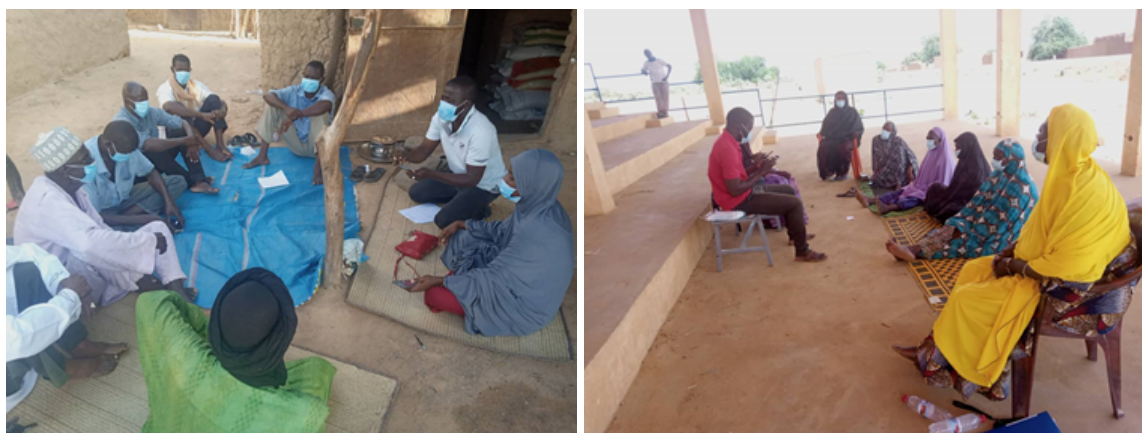
Focus group with men and women from Abala

For the purposes of this report, this analysis is at the micro level, focusing on women and men, households and communities. Here, the analysis focused on the definition of roles, relationships, needs and priorities in relation to the context, as well as the weight of cultural aspects.