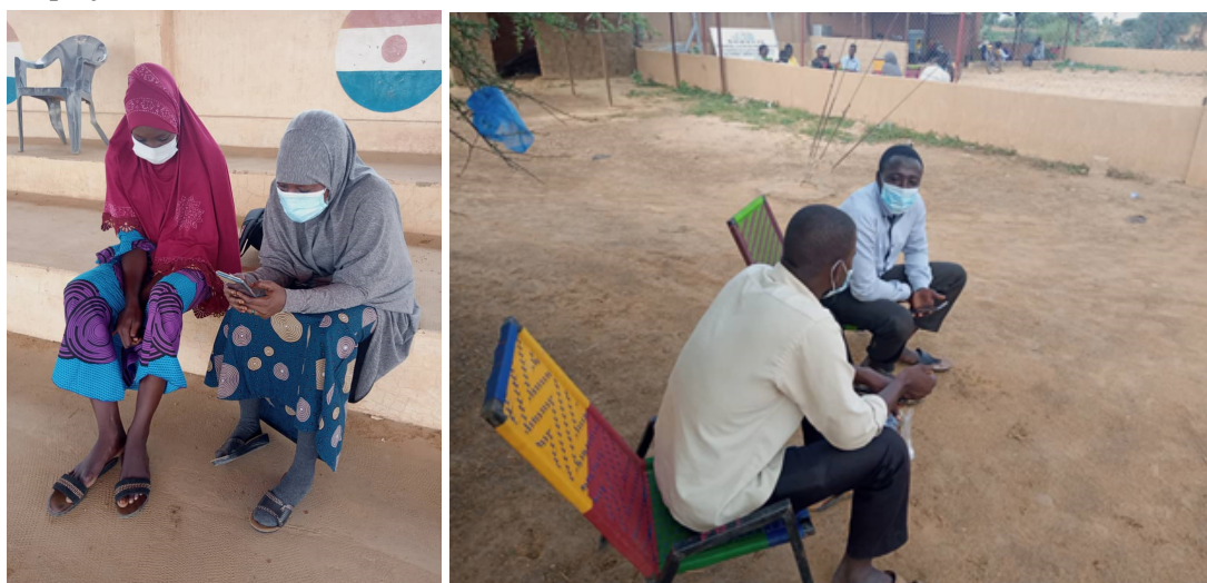
Interviews with a young female leader in Bankilaré and a young leader in Abala

This gender analysis was an opportunity to present the project's activities in order to get feedback for gender sensitivity during these activities. This approach will allow the project undergoing this analysis to propose activities that will reduce inequalities related to gender stereotypes but also to take into account socio-cultural norms related to gender. This will notably ensure the principle of "DO No Harm" in order to avoid exposing our beneficiaries, especially young women who will be targeted in the project, to risks and threats.