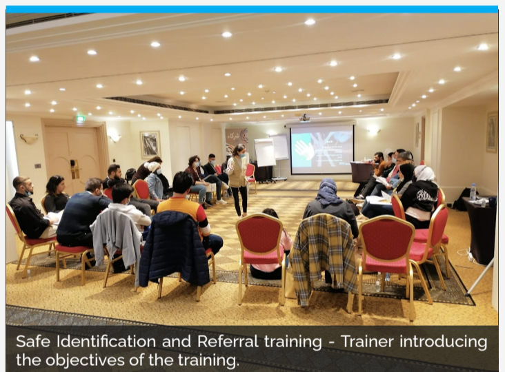
Safe Identification and Referral training - Trainer introducing the objectives of the training.

“ The training was full of interactive activities and we felt very encouraged to participate openly. - A female focal point from the North ”