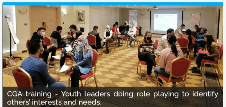
CGA training - Youth leaders doing role playing to identify others' interests and needs.

The Safe Identification and Referral training aimed to empower the selected youth leaders to better understand the elements of sexual and gender based violence (SGBV) [gender, violence, power, informed consent], examine the health, psychological, and social consequences of SGBV, describe the guiding principles of working on SGBV, and provide youth with information on conducting safe referrals based on a survivor centered approach. Building the capacity of youth leaders in safe identification and referral of cases of violence will prepare them to become allies and champions of gender equality and prevention of VAWG.