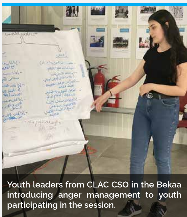
Youth leaders from CLAC CSO in the Bekaa introducing anger management to youth participating in the session.

30 Sessions were delivered by 8 CSOs across 3 Lebanese regions in April 2022.