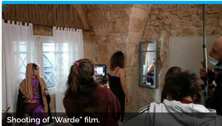
Shooting of "Warde" film.