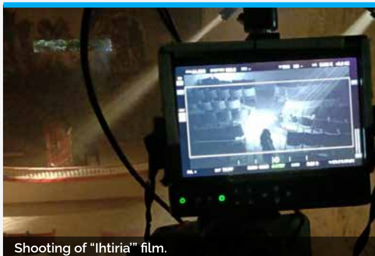
Shooting of "Ihtira" film.