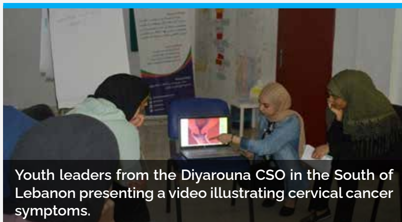
Youth leaders from the Diyarouna CSO in the South of Lebanon presenting a video illustrating cervical cancer symptoms.