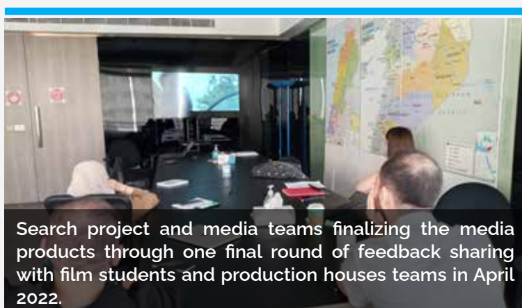
Search project and media teams finalizing the media products through one final round of feedback sharing with film students and production houses teams in April 2022.