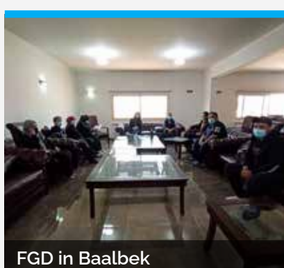
FGD in Baalbek

The first round of Focus Group Discussions (FGDs) targeted community members from locations with high water-related conflict issues including: Deir El Ahmar, laata, Yammouneh, Dar el Ouassa, Jenta, Yahfoufa, Qaa Baalbeck, Chlifa, Aarsal, Bouday in Baalbeck, Haouch el Harime, Khiara, and Ghazze in West Bekaa.