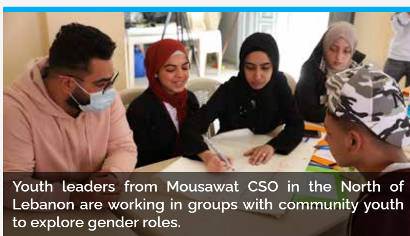
Youth leaders from Mousawat CSO in the North of Lebanon are working in groups with community youth to explore gender roles.

"I've leveraged a lot from the information provided in this training since it's relevant to my job, as I work in raising awareness about women's health."