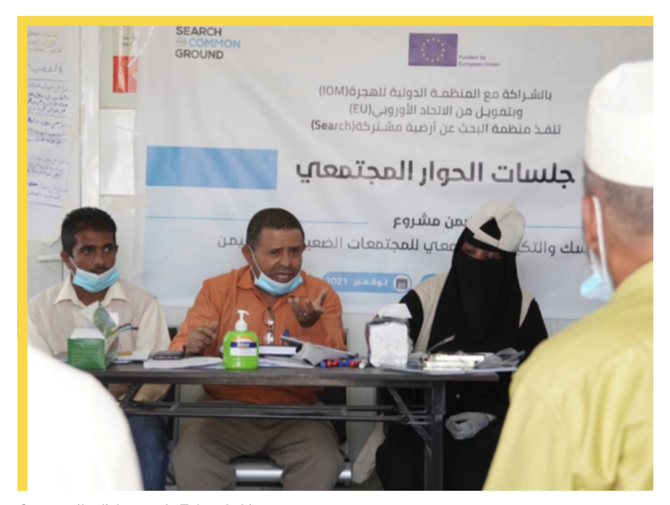
Community dialogues in Tuban-Lahj

Search is providing a rapid action to support the International Organization for Migration (IOM) in the implementation of their EU-supported project on 'Enhancing Resilience in Vulnerable Communities in Yemen'. The project promotes resilience in Yemen, through supporting the management and the reintegration of IDPs, addressing community recovery needs in targeted communities, and strengthening relations and coexistence of IDPs with the host communities.