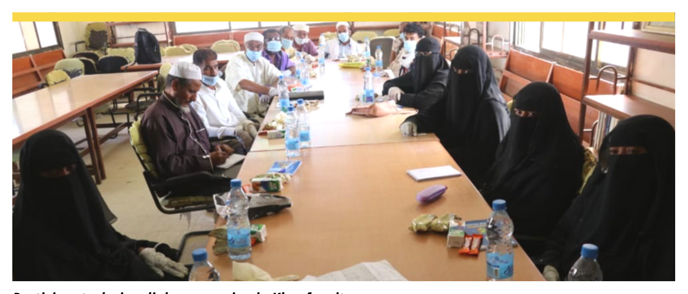
Participants during dialogue session in Khanfer city

The UNDP's Supporting Resilience and Livelihood Project in Yemen (ERRY II) was a multi-sectoral project involving various national and international organizations. The project aimed to support the crisis-affected communities to enable them to better manage local risks and shocks, as well as to build their resilience and self-reliance throughout the longstanding conflict. Search has led social cohesion efforts through Search's CDA to help local communities collaboratively identify and address local drivers of instability and conflict, while working together to manage and mitigate local conflicts. Search also identified and trained male and female IMs in mediation and facilitation skills to promote social cohesion and mediate conflicts at a local level.