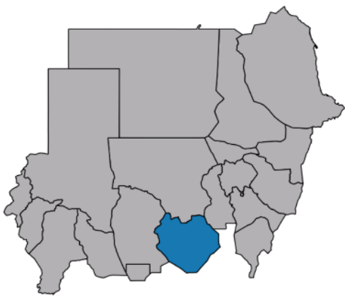
South Kordofan state

The women of Sudan remain one of the most marginalized groups in the country even though they make up half of the population, and play vital roles in both the labor force and family sphere. Women continue to be victims of human rights violations, displacement as well as low social and economic status that is heightened as a result of constant conflict and instabilities throughout the country. These challenges, in addition to traditional and social norms, create great obstacles in achieving equal access to and control of resources and financial services that ultimately lead to women's empowerment.