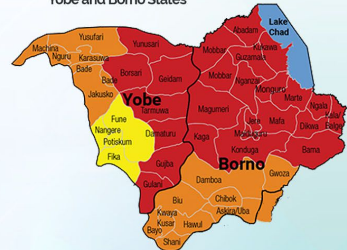
Yobe and Borno States

The project is funded by the Government of Japan and is aimed at training women and girls in livelihoods and income-generating activities, leadership and conflict transformation skills. The project has increased access to productive resources and business development opportunities in Yobe and Borno States.