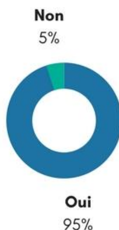
Figure 5 - Has the Caravan changed your view on tolerance?

The first conclusion that arises from the survey and the focus group discussions with beneficiaries of the Caravan was a clear evolution in their views of the concepts of tolerance, diversity, violence, freedom of thought, and women's rights. In focus group discussions, women and youth expressed their desire for opportunities and spaces to spread the Caravan's impact at the community level, as they saw the goals and values of the Caravan as being important to their personal and communal lives.