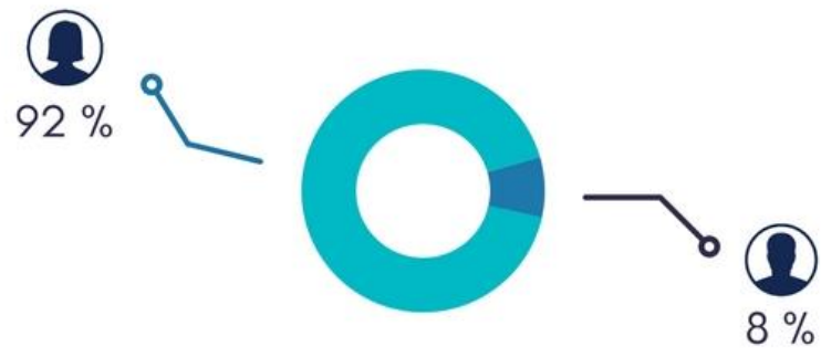
Figure 3 – Gender representation of respondents