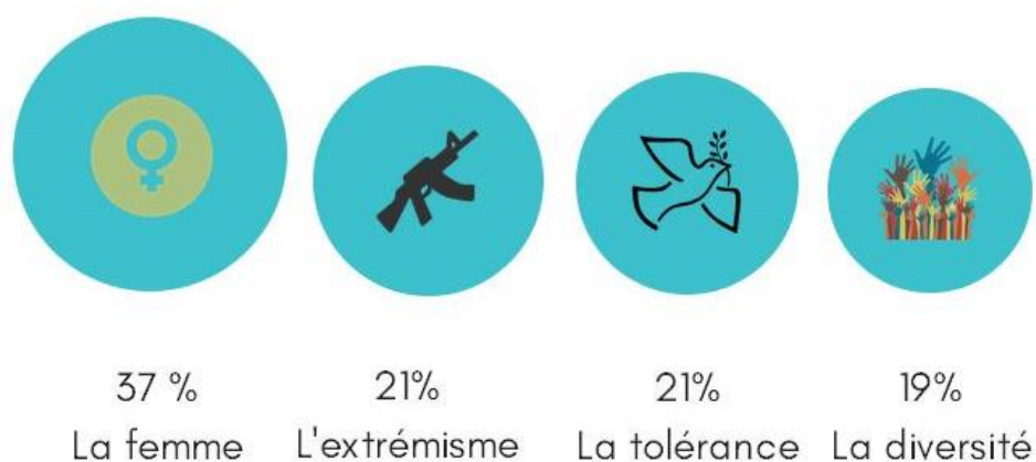
Figure 10 - If you were to produce a film, what subject would you choose?