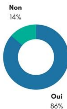
Figure 6 - Do you think that certain stereotypes surrounding women were defeated after the caravan?