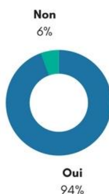
Figure 7 – Do you think peer-to-peer education is effective in mitigating stereotypes?

The Caravan also allowed for greater self-expression among women and youth in marginalized communities through the creation of youth-led films and safe spaces for dialogue. As a result, women and youth stated that they have developed a new status of themselves in their community and reported feeling increased self-esteem due to their feelings of being valued during the “Women’s Caravan for Peace” initiative. This increase in self-esteem has positively impacted the sustainability of the project, as it will contribute to the emergence of capable and credible leaders within the group.