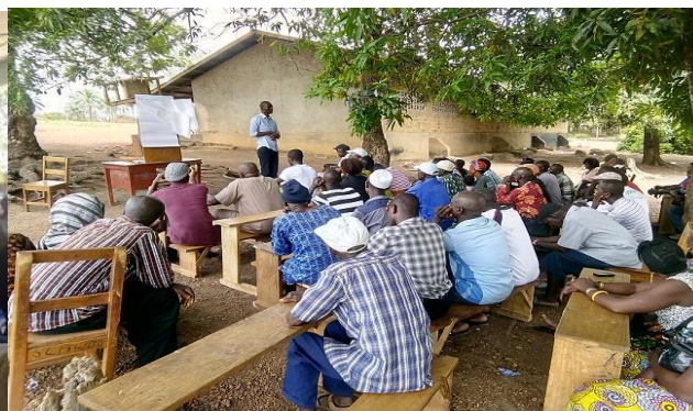
Chiefdom discussion in Makari chiefdom