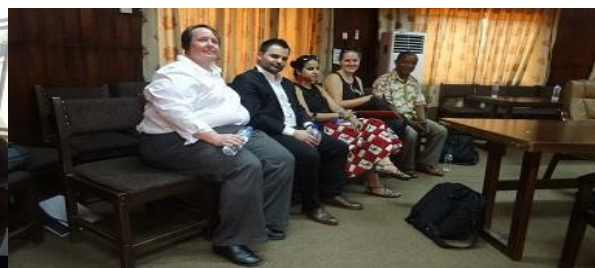
CEPPS Partner's meeting

Objective 1: Increase the participation of women and disadvantaged groups in debates and dialogue sessions relating to the March 2018 general elections