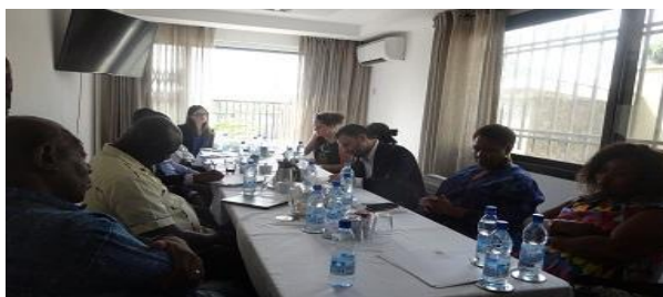
Engagement with CSOs

Pre-Election Assessment: In collaboration with other CEPPS partners, Search participated in a week-long pre-election assessment (22-26 January 2018). The purpose of the mission was to assess preparations for the March 2018 general elections and support Sierra Leone's efforts to conduct credible and peaceful polls. It also introduced the project to the stakeholder community through which relevant electoral public policy issues related to the program activities were identified. Representatives from all the consortium partners took part in this exercise and it provided partners an opportunity to examine appropriate approaches for on-field collaboration in program implementation. The assessment team visited, among others, the United States Ambassador, USAID's country team, the European Union Delegation in Sierra Leone, the United Kingdom Department for International Development (DFID), the United Nations Development Programme (UNDP), the National Electoral Commission (NEC), the Political Parties Registration Commission, Civil Society Organizations, and the Media. At the end of the mission it was agreed that USAID and the International Republican Institute coordinate on the development of the electoral poll questionnaire before sign-off by the U.S Embassy, and that Search and Internews work closely with World Vision and their domestic networks for successful implementation of the activities. The pre-elections assessment report has been shared among all CEPPS members