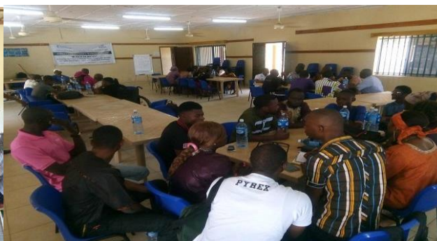
Group discussions in Bombali district