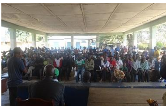
Chiefdom-level discussions in Gboajibu