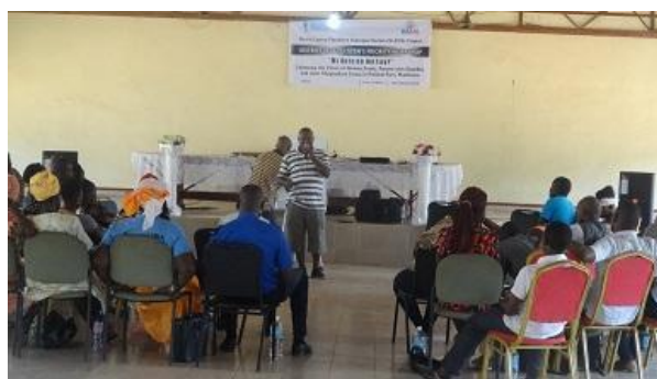
NEC staff facilitating workshop in Kenema district

Each workshop agreed on a list of priorities, including: access to affordable and quality health care, access to quality education for all including compulsory primary education, access to loans and livelihood opportunities, improve the road and housing infrastructure, provision of electricity and safe drinking water, introduction of mechanized farming to improve on yields, frequent interface sessions with politicians and improve governance systems. These priorities will be followed by community-led evaluation committees who will continue to provide space for public policy dialogue and mediation at all levels. These workshops established new relationships and consolidated Search’s local networks; identifying new areas of collaboration and cooperation with CSOs, community stakeholders, local advocacy groups.