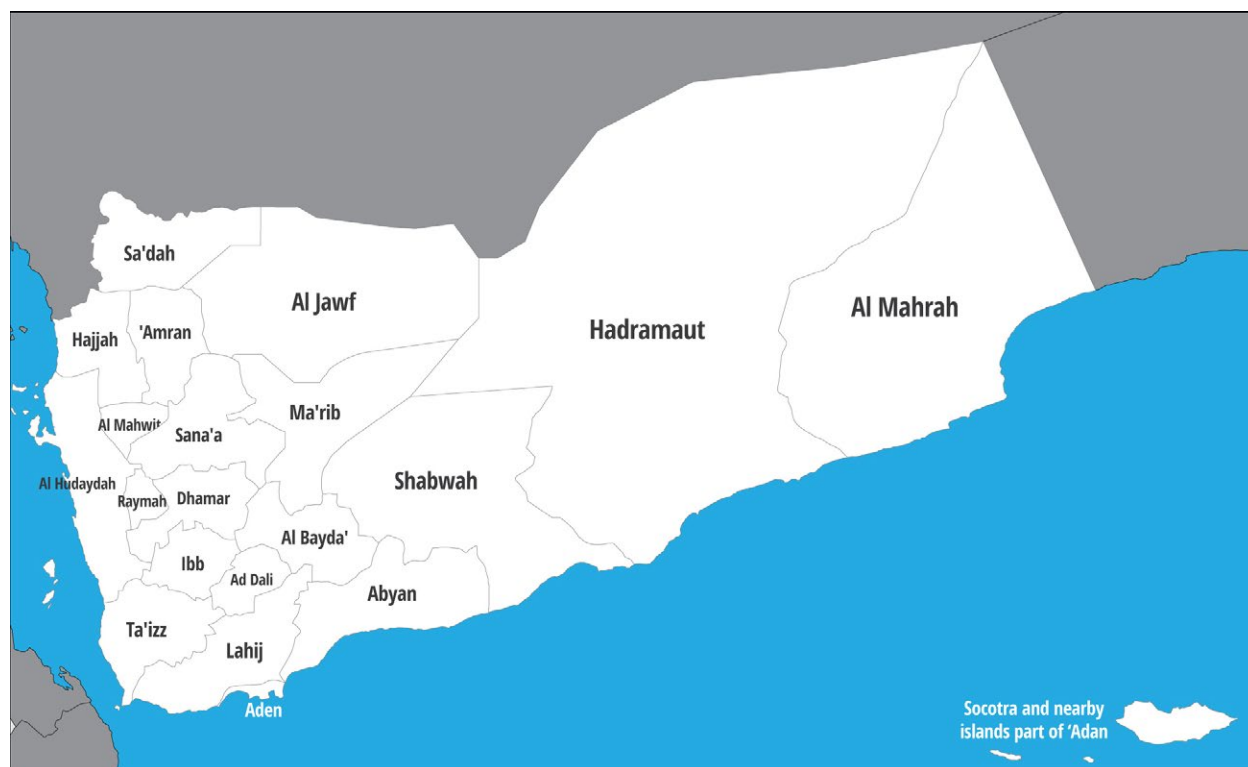
FIGURE 1: Map of Yemen, April 10, 2017

Despite the resurgence of tribal identity in the south, there is a marked difference between the tribal structures in Yemen's governorates today. Governorates with stronger tribal affiliations, such as Sa'adah, Amran, Al Jawf, Ma'arib, Al Bayda', and Ad Dali', correspond with historical North Yemen. In other governorates, especially those in the south such as Al Hodeidah, Ibb, Taiz, Hadramawt, and Al Mahrah, tribal structures are still recapturing their traditional position and while tribal leaders hold authoritative roles in society, Yemenis in these governorates are more likely to align with a regional identity rather than their tribal affiliation.