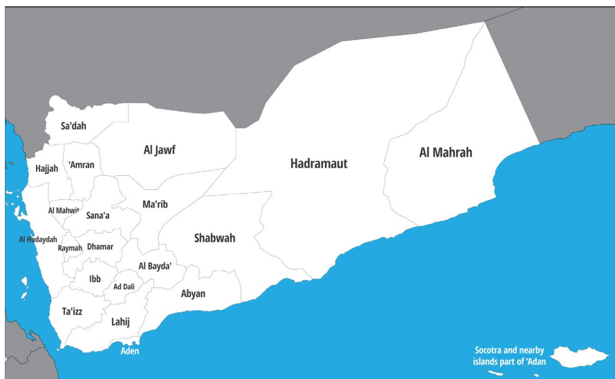
FIGURE 1: Map of Yemen, April 10, 2017

Despite the resurgence of tribal identity in the south, there is a marked difference between the tribal structures in Yemen's governorates today. Governorates with stronger tribal affiliations, such as Sa'adah, Amran, Al Jawf, Ma'arib, Al Bayda', and Ad Dali', correspond with historical North Yemen. In other governorates, especially those in the south such as Al Hodeidah, Ibb, Taiz, Hadramawt, and Al Mahrah, tribal structures are still recapturing their traditional position and while tribal leaders hold authoritative roles in society, Yemenis in these governorates are more likely to align with a regional identity rather than their tribal affiliation.