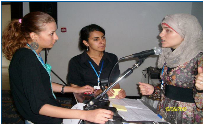
THE TUNIS YLC HOSTS A COMMUNITY ROUNDTABLE ON CHILD LABOR.

Youth participation in some of the YLCs waned and slumped as the project went on. This happened for a number of reasons, all of them issues that could have been addressed in the project's design. The activities failed to take participants' school schedules, religious holidays, and other youth obligations into account. Consequently, some youth lessened their involvement with the YLC during the height of the school year. Others participated in the YLC during the school year but then left the region once the school year ended. Additionally, there were some youth who joined the program only because they were interested in the trainings and they had no intention of engaging with the community activities. The project hosted all of the trainings up-front, so youth were easily able to get the training and then drop out of the project. A more strategic approach might have been to stagger the trainings and use them as an incentive to engage more youth into the project for the long-term.