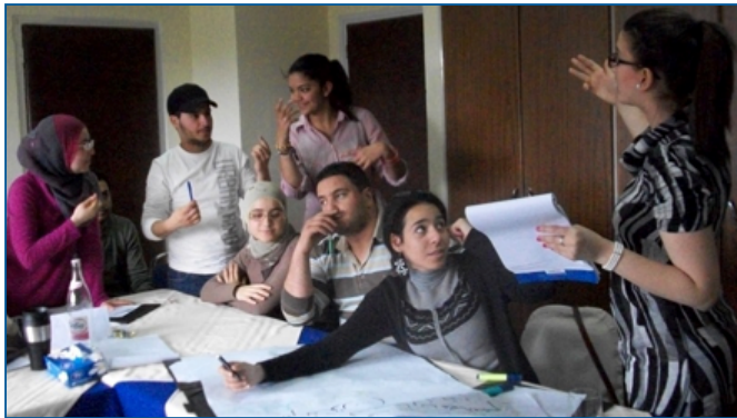
YLC MEMBERS PARTICIPATE IN A LEADERSHIP TRAINING ACTIVITY.

skills. All trainings followed the Common Ground model, which combines traditional leadership skills with the ability to resolve conflicts collaboratively by understanding differences and acting on commonalities. SFCG scheduled trainings all upfront at the beginning of the project in order to give youth a solid footing for the next phases. This strategy proved to have unintended negative consequences that became apparent as the project went on, since youth participation rates declined after the initial training phase. But the trainings were able to teach all of the core youth valuable skills that many of them carried on beyond the classroom to lead change in their communities. A series of more than 90 different trainings taught youth about media production, conflict analysis, group facilitation, leadership skills, and creating CSOs. The youth participants made good use of these lessons during the next stages of the project, whether it was through producing local radio segments or registering their YLC as an official organization.