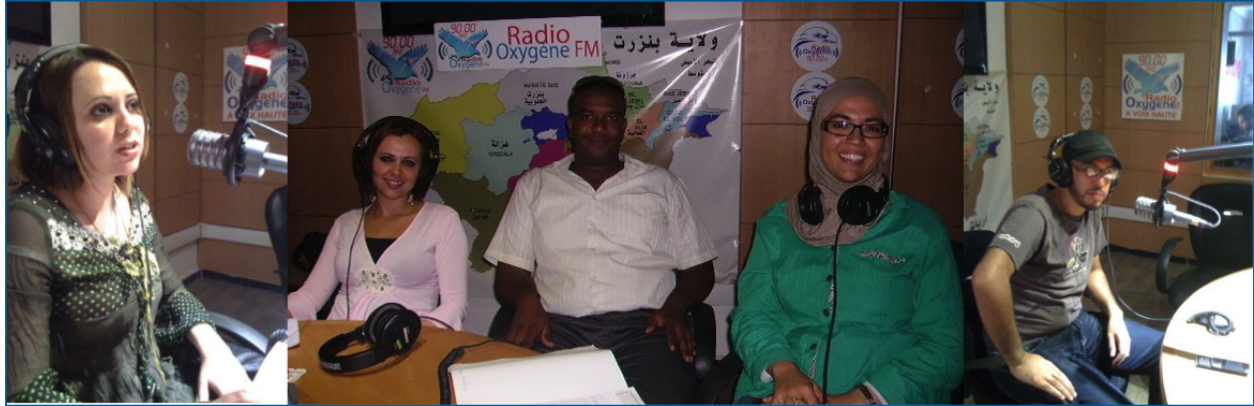
THE YOUTH LEADERS' COUNCIL OF BIZERTE MAKES AN APPEARANCE ON A LOCAL RADIO STATION.

The stories of the YLCs demonstrate the positive impacts of the project and suggest space for improvement in future work.