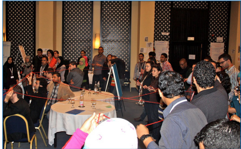
MEMBERS OF THE YLCs PARTICIPATE IN A GROUP ACTIVITY DURING THE CLOSING SESSION OF A NATIONAL MEETING.

Community actions by all fourteen of the YLCs laid the groundwork for communication and collaboration between youth, their communities, and their local governments. During the preliminary mid-term evaluation, SFCG interviewed 13 local officials to gauge whether or not their attitudes towards youth leadership and youth participation had changed. A majority of the responding officials reported positive views of the YLCs, and they saw YLCs as effective communication platforms for citizens and government officials. xii In several provinces beyond those highlighted here, local authorities welcomed youth as partners, voluntarily approaching the councils. In three instances, the officials actively requested to meet or collaborate with YLCs. Many YLCs continue to have strong partnerships with local officials and regional agencies, including several ministries: Environment, Interior, Defense, Culture, Tourism, and Employment.