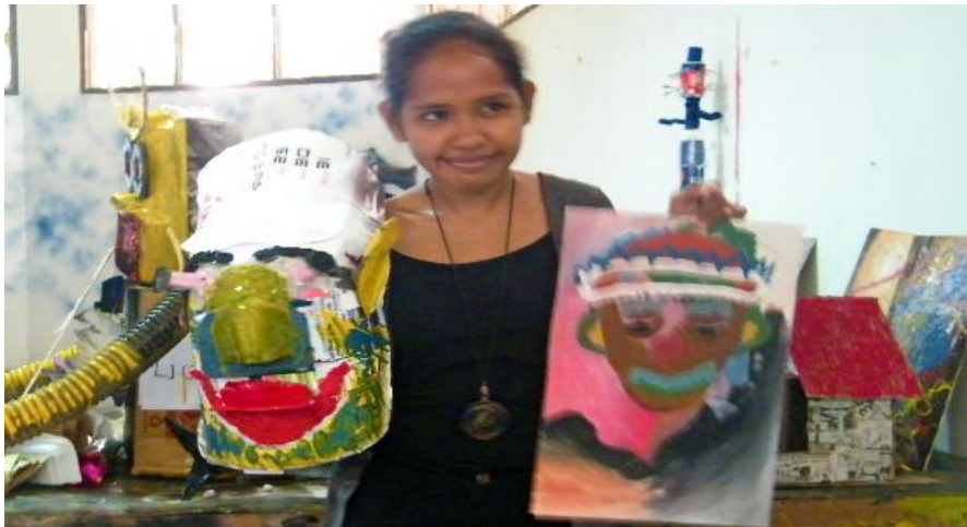
Figure 2: Art class student

Finally, regarding the art classes, the Art Class Newsletter states that "The objective of the art class was to increase capacities and explore talents of young men and women in the arts, and to create network of friendship among youth interested in the arts and who want to contribute to peacebuilding and the development process." When interviewed, the art class youth were by far the most shy, and had trouble articulating what they saw as the needs and priorities of youth in their areas. A small number of them mentioned learning to be more confident and about artistic methods, but the effect was small and only two of the eight youth had found a way to use or apply something that they had learned. None of the youth mentioned learning how to use art as a tool for self-expression or sharing peace messages in their areas. Similarly, the Arte Moris KII showed that the art class facilitators did not themselves view peacebuilding or conflict resolution to be a central component to their activities. For this reason, while the design themes of the art class may have been relevant to conflict resolution, the practical implementation of the art class was not highly relevant to the needs of youth beyond the fact that they benefit from almost any type of extra-curricular engagement.