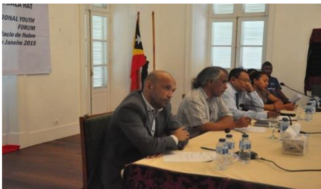
Figure 1: Internet access panel at 4th national youth forum

The USAID Program Manager interviewed for this evaluation is well-known to the SFCG staff, and has been closely involved in the YEPS project since its conception. She shared that the YEPS project was created under USAID's previous set of strategic objectives, which emphasized peacebuilding. USAID's newest Country Development Cooperation Strategy (CDCS), which covers 2013-2018, does not contain a peacebuilding focus. The YEPS program can, she shared, be seen as relevant to the existing CDCS's