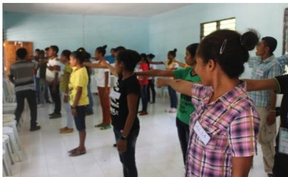
Figure 3: CLT participants in Oecusse

radio programs. According to the SFCG Media Manager, youth shared that they preferred reading the comic books to other activities including reading the newspaper and listening to the radio. With their stories and pictures, the comic books are very entertaining. When they listen, they don't often hear the whole program and may depend on hearing a re-broadcast to hear the entire message. Also, she shared; the mid-term study they conducted showed that youth generally prefer to listen to music. If youth read the books, however, they have the physical copy with them to re-read whenever they would like.