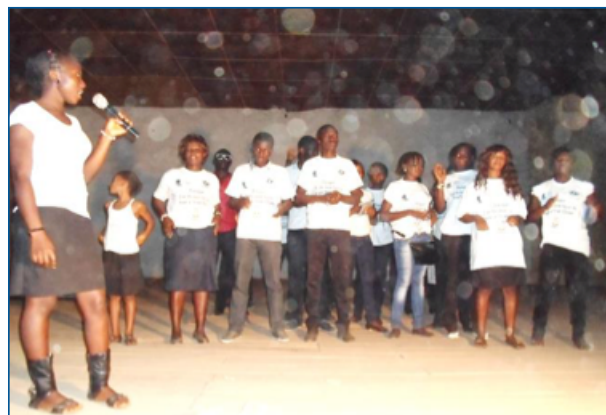
NON-VIOLENCE FESTIVAL IN GUINÉE, KANKAN

In 2010, the mid-term project evaluation revealed increasing levels of violence in regions affected by mining activity. This was largely the result of the transitional government challenges of the contracts previously negotiated with mining corporations. As a result, the scope of the project was changed to include these areas where violence was a serious concern. The same process was used as in the original regions, with the difference being that this time SFCG learned from previous lessons and called on adult monitors to support of youth initiatives. 4 adult monitors coached the 10 selected organizations . The adult monitors were tasked with increasing youth credibility since local authorities were still associating youths with vandalism