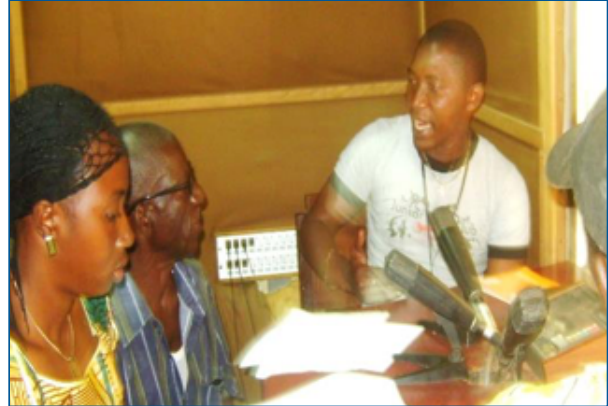
A YOUTH TRAINING AT THE LIBRARY IN FRIA

phase started with the mapping of existing youth associations with the assistance of the Youth Ministry and prominent youth members. In Conakry for example, an initial mapping was conducted with the help of an influential member of a local gang that is active in the different districts of the city. Because of his affiliation and familiarity with the various gangs of the city, his collaboration helped to include those groups in the project from the very start. During this phase, SFCG identified and selected 16 local facilitators and 28 adult mentors and coaches to aid the implementation of project activities.