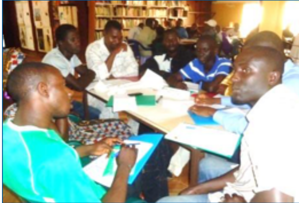
A YOUTH TRAINING AT THE LIBRARY IN FRIA