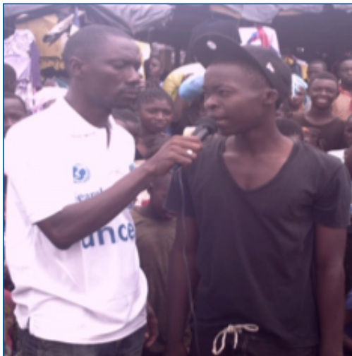
CAPTION TEXT GOES HERE

Results obtained from tests conducted from trainings in Conakry, Guékédou, Kissidougou, Macenta and N'Zérékoré showed significant improvements in youth knowledge of the five main themes covered in the trainings. The initial knowledge of these themes among the youth was very limited prior to trainings, with over half of them failing a pre-test. Subsequent training workshops had a clear impact on the trainees, with the same knowledge tests passed by 85 percent of participants after the trainings.