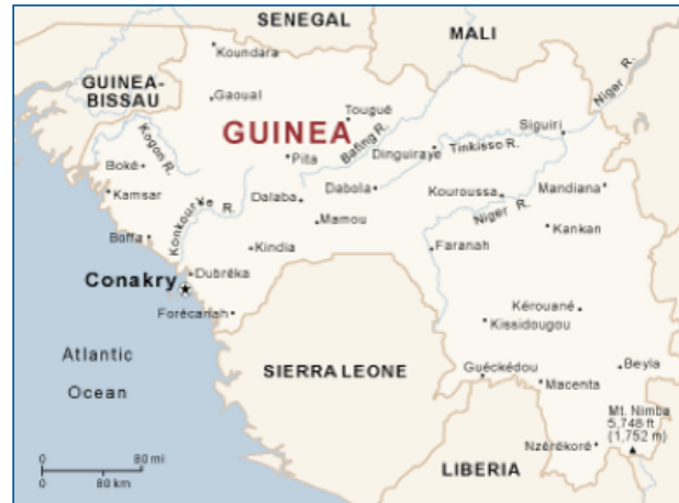
MAP OF GUINEA, FROM NATIONAL GEOGRAPHIC

During this critical socioeconomic context, youth in Guinea turned to violence. Across the country, youth gangs emerged. This was a novel phenomenon in Guinea's social landscape. Initially developing in schools, youth gangs migrated to surrounding neighborhoods where they gained so much power that a young person's personal safety was only guaranteed through gang allegiance. As these gangs engaged in violent, illegal, and threatening behaviors, they tainted the reputation of youth as a whole. Self-proclaiming themselves as victims of the system, gang members deliberately excluded themselves from social life and dialogue, and instead chose violence as alternative means of expression. The key question then became: how can the youth of Guinea overcome the draw to violence and become active, engaged, and non-violent actors in their communities?