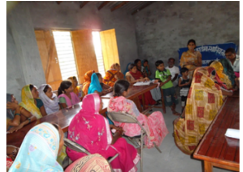
Local women participating in orientation with local decision makers. (NED, Women Building Peace in Eastern Terai Project)

Woman in Bandipur VDC, Siraha (NED Evaluation Report)